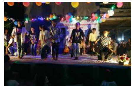
The Youth group from Krang Dong, a small church 20 miles away came to support this remote outpost with some songs