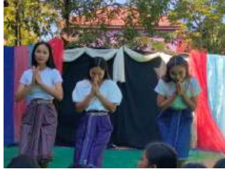
Plas Prai students perform a traditional Cambodian dance