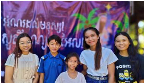
A Joyous time of celebrating Jesus in Choam Srae village Pray for the fledgling church in this remote outpost