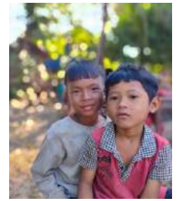
Village boys from Choam Srae