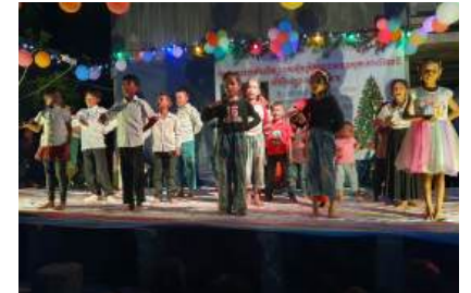
At Sanlong Chey village, children from the new church 20 miles away came to support this new outpost with some action songs