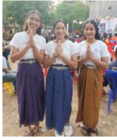
The Welcome Team