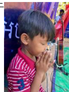
Pray for Cambodia

"The true light, which gives light to everyone, was coming into the world." — John 1:9