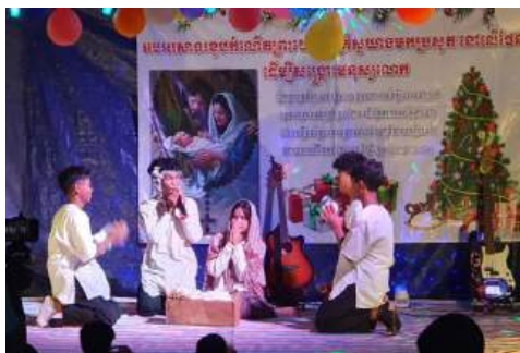
"The Light shines in the darkness ..."