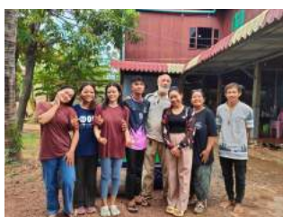
Baptism candidates with PP staff