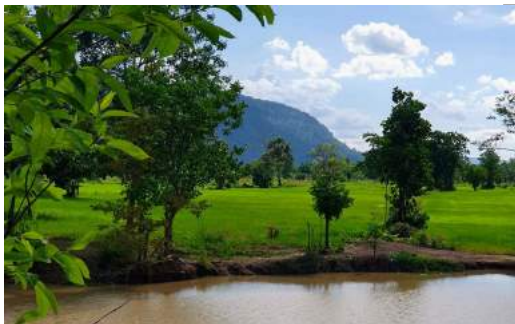
The view after a few rains—the rice paddies are green again