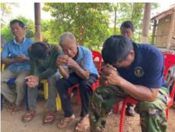
New believers in Chey Sen district