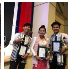
Our '23 grads finished DTS