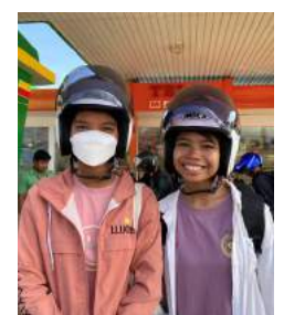
Ready to head out to the harvest