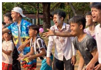
Plas Prai students—Khmer New Year April '24