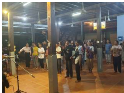
Friday Night Worship and Bible Study