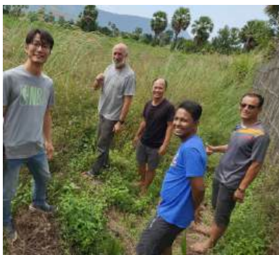
Anointing the New Ministry Center site Thavik (gr 10) & new SS book