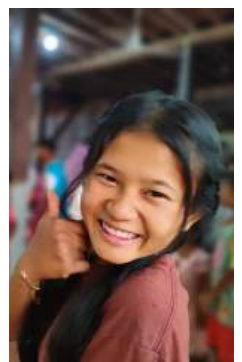
Joy in Community