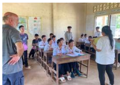
Recruiting 9th grade students for Plas Prai