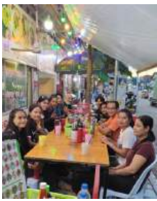
Visiting our YWAM students