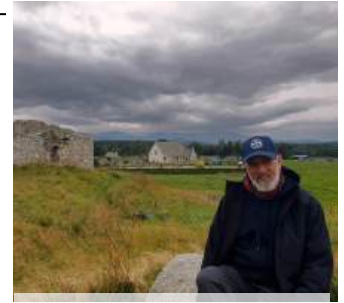
At Castle Roy near Nethy Bridge

“Blessed is the one whose strength is in You, whose heart is set on pilgrimage.” - Psalm 84:5