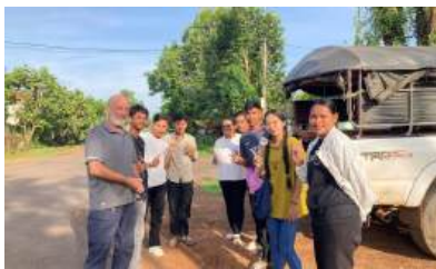
Heading out for Plas Prai recruiting trip