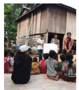
Sunday School Ministry