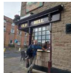
1st Day in Scotland