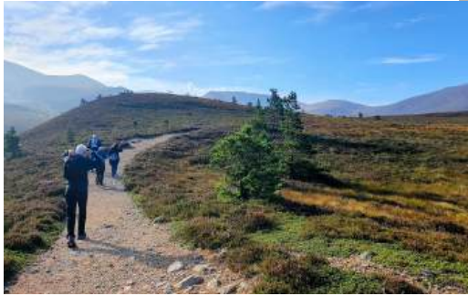
Prayer walk near Chalamain Gap in the Scottish Highlands