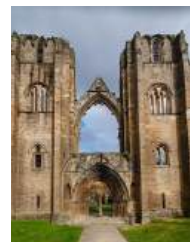
The Elgin Cathedral