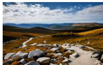
A prayer trail in the Scottish Highlands