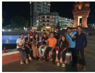
Visiting our students at YWAM, Battambang