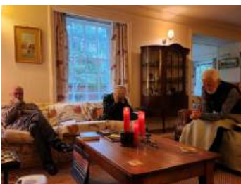
Our Prayer Room at the Grey House